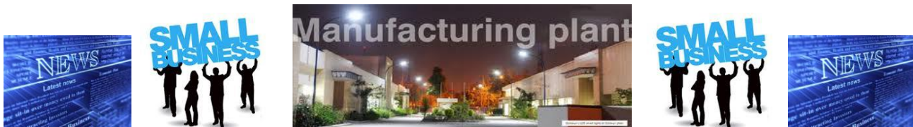
Television Business News Broadcast