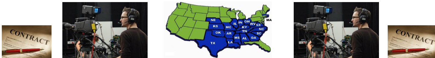
Manufacturing Plant Business News